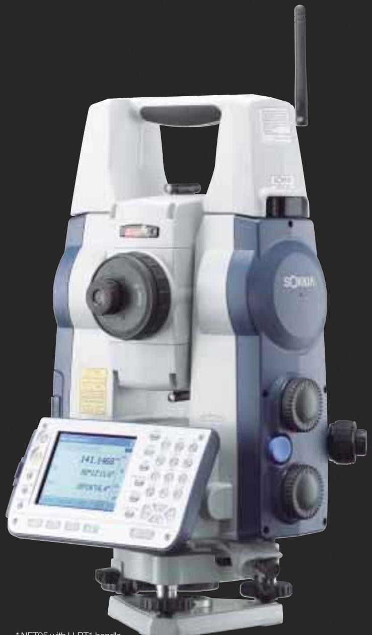
* NET05 with H-BT1 handle