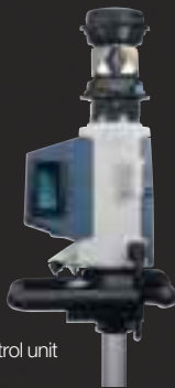
RC-PR3 on-demand remote control unit with ATP1 360° prism